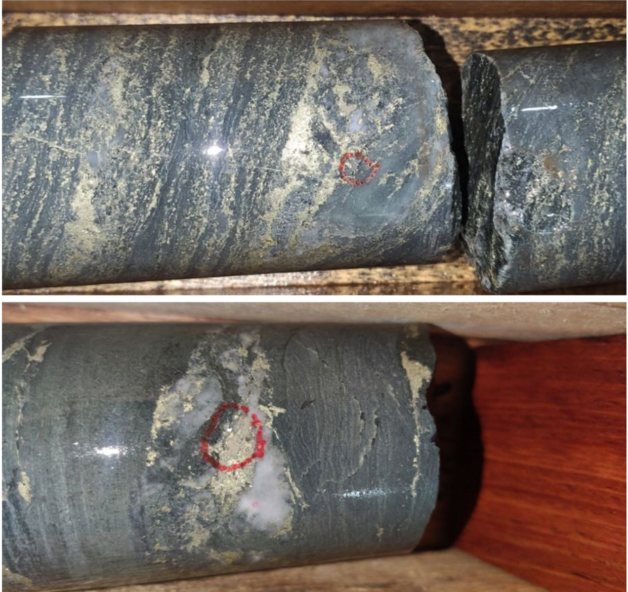
Photo 1: Top: CD-88 Core Photos: Top : Visible gold in at depth interval 61.2m, associate with silica flooding overprint on VMS Cu-Au-Ag system; Bottom: Visible gold, circled on margin of quartz-sulphide stringer assemblage at depth interval 65.7m.